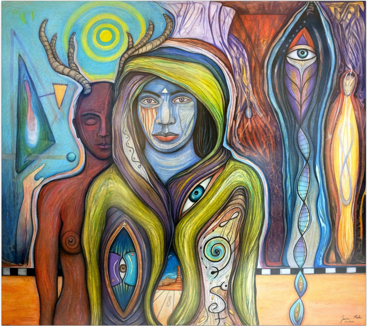
That Which Awakes Us