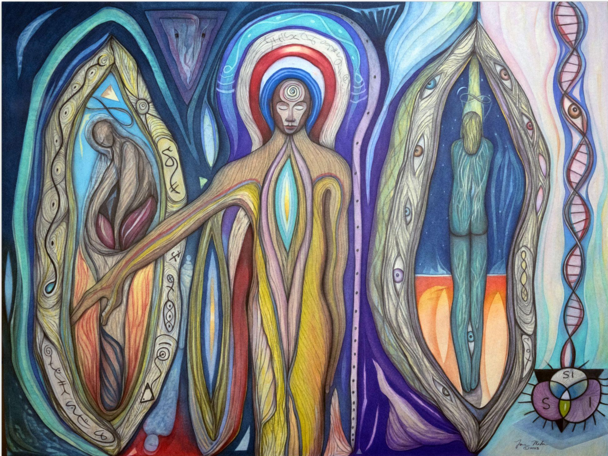
Theater of Life