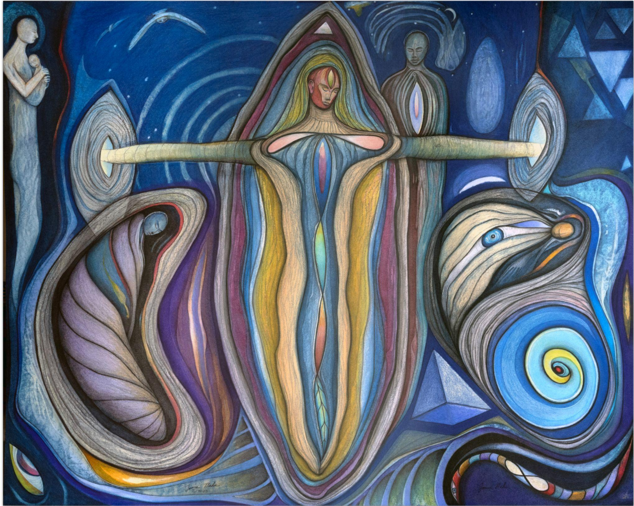
Evolution of Consciousness