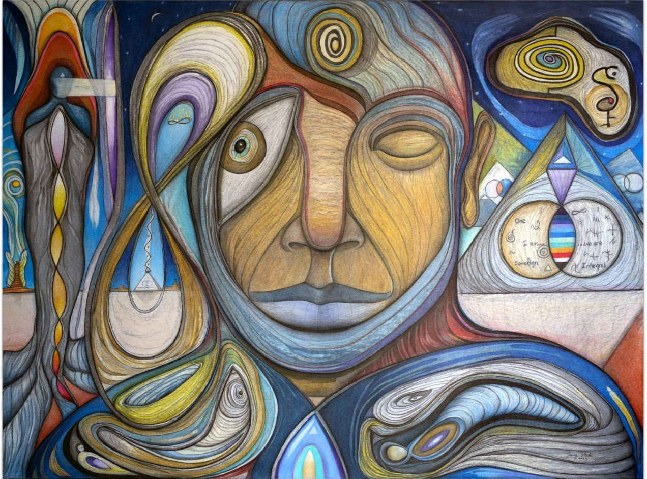
Evolution of Consciousness