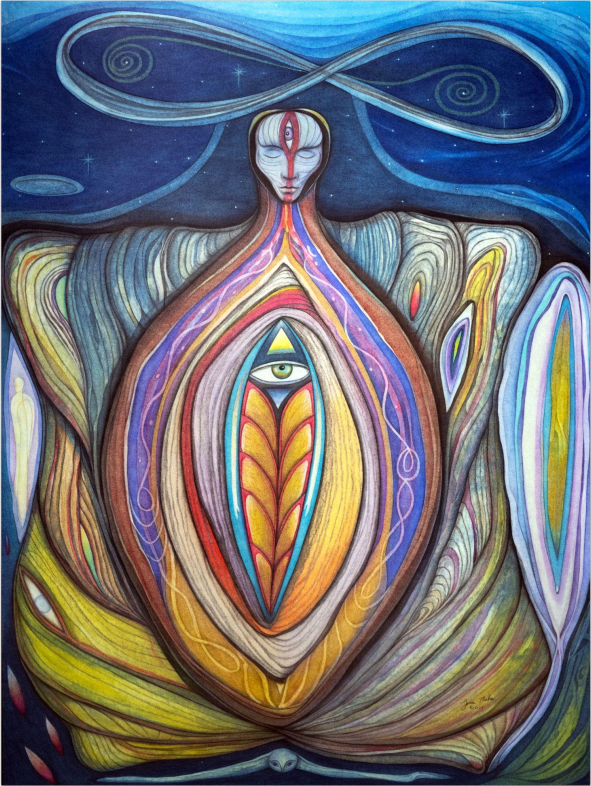
Intricacy of the Integral