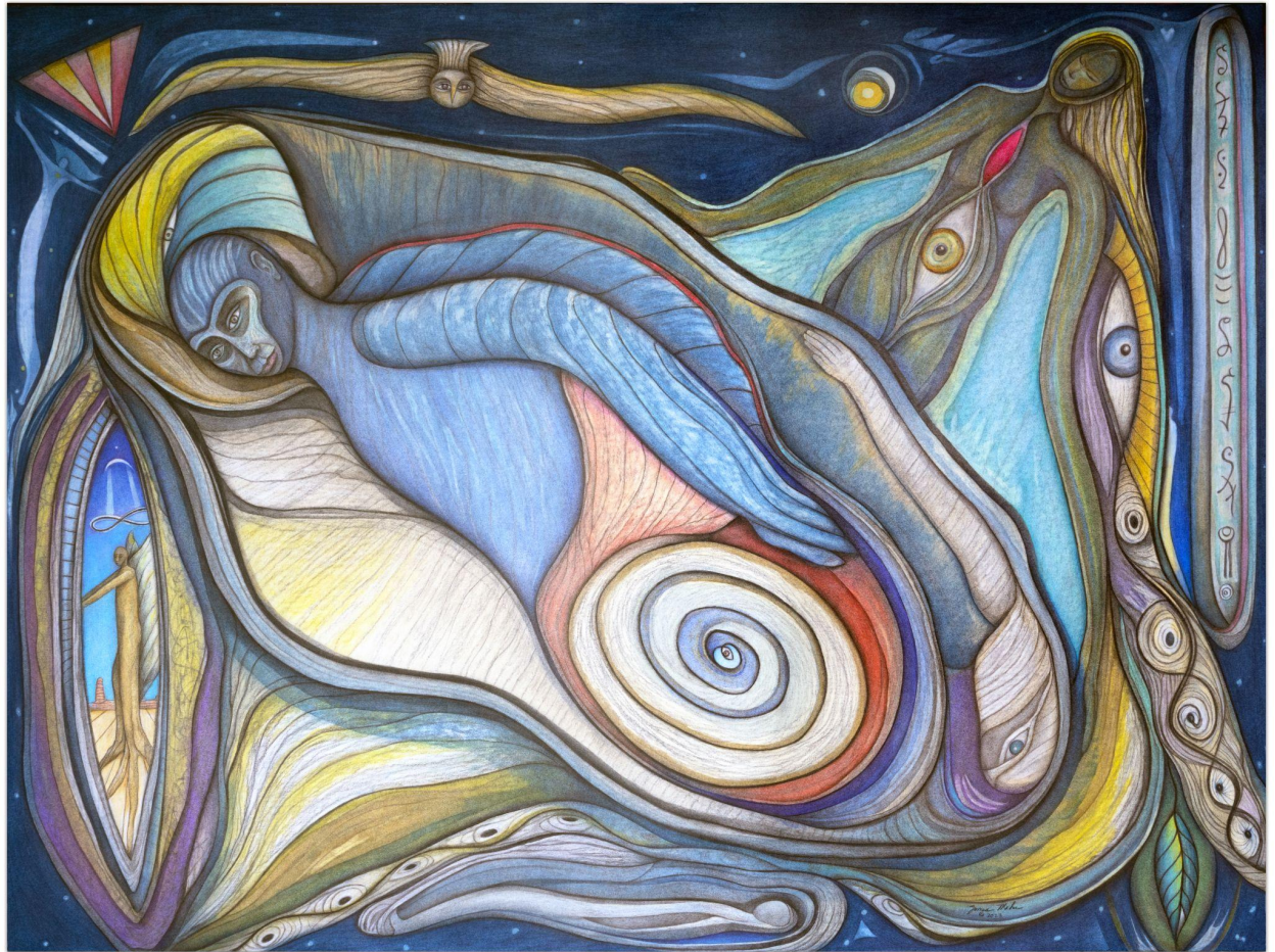
Interpreters of Truth